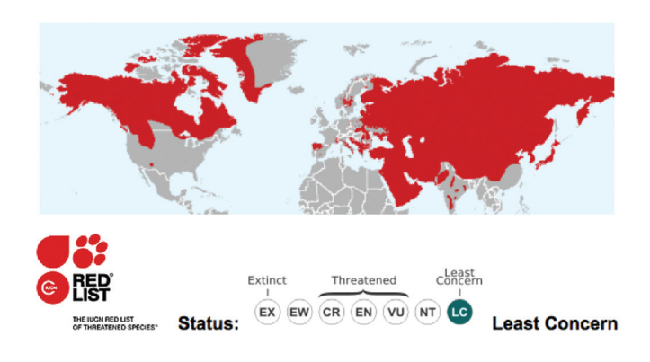
IUCN Wolf Distribution Map illustrating wolves as a species of "least concern"