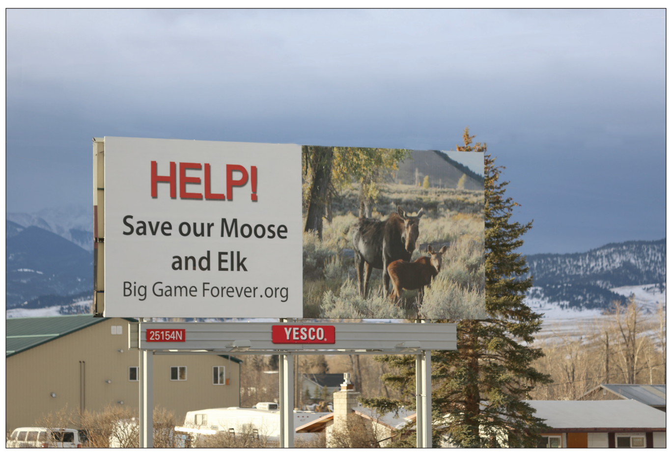
Big Game Forever billboard outside Yellowstone National Park