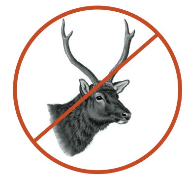
NOT legal in a spike bull unit.