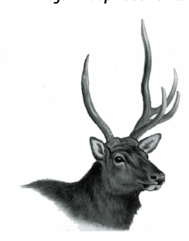
Legal in a spike bull unit.