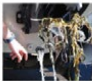
Drain Boats & Recreational Vehicles