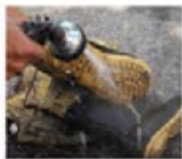
Rinse/Dry Boots & Waders