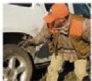
Clean Trucks & Trailers

Learn to identify invasive species in your area