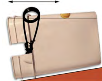
Tilt the trap so bait cannot be seen from above.