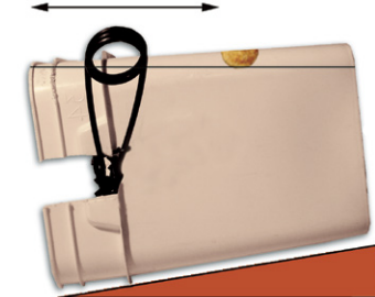
Tilt the trap so bait cannot be seen from above.