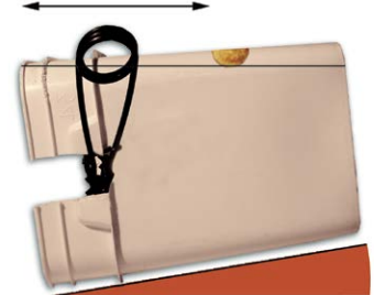
Tilt the trap so bait cannot be seen from above.