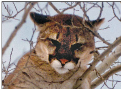
Adult female head