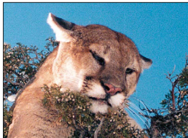
Adult male head