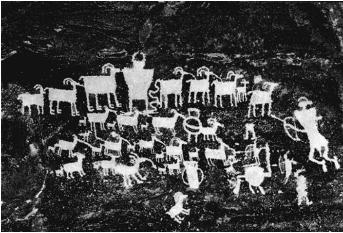
Petroglyph - Nine Mile Canyon, Wellington, UT