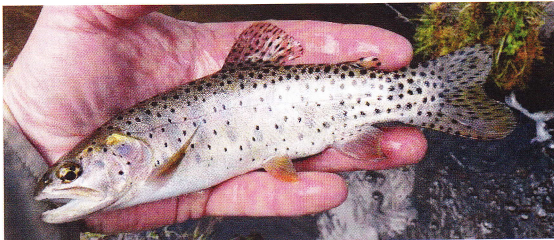
Bonneville cutthroat trout.

Bonneville cutthroat trout (BCT) are the only trout native to the Bonneville Basin. Efforts to conserve and protect the subspecies include establishing self-sustaining populations in streams with adequate habitat. North Fork Corn Creek (tributary of Corn Creek near Kanosh, Millard County) currently contains no fish and is isolated from upstream movement of fish from Corn Creek by a natural barrier. A small remnant population of BCT occurs in nearby Pole Creek (tributary of Clear Creek, Sevier County). It is proposed that BCT be transferred from Pole Creek to North Fork Corn Creek in summer 2012 to provide another refuge for this population. This action is part of a joint effort by the Utah Division of Wildlife Resources and the Fishlake National Forest to help decrease threats to the subspecies, ensure long-term conservation, and preclude the listing of BCT under the Endangered Species Act. Also, sport fishing opportunities will be provided in North Fork Corn Creek where there are currently none. The proposed introduction was presented to the Millard County Commission in spring 2011 and received their full support. In addition, the project has been submitted for approval through the state Resource Development Coordinating Committee (RDCC).