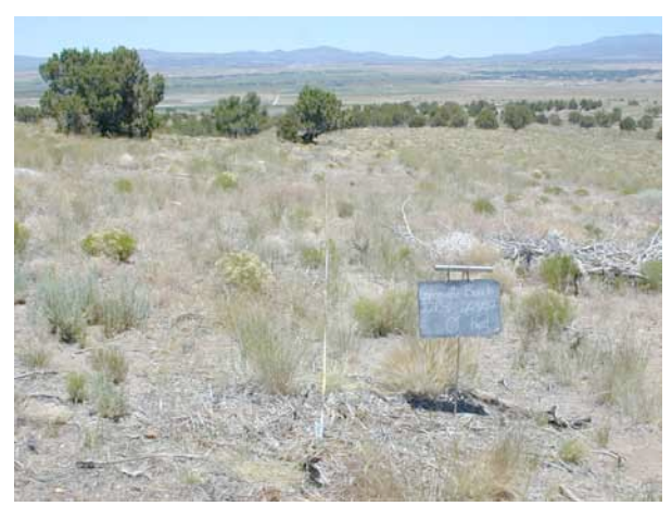
These before-and-after photos show how habitat improved after vegetation treatments. The new plant growth benefits various species, including mule deer and sage-grouse.