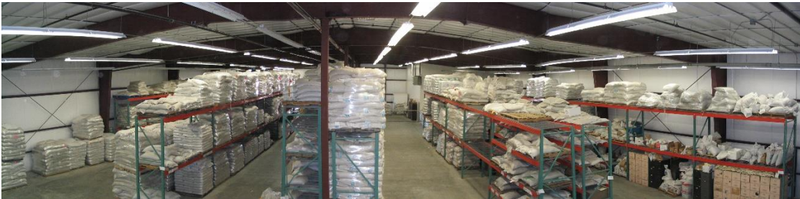
Seed Warehouse at DWR’s Great Basin Research Center.