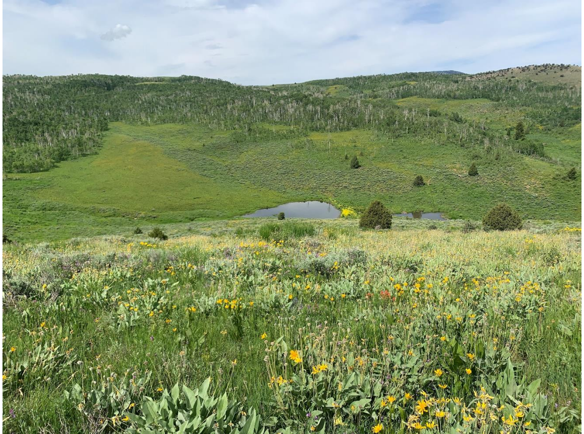
View of the Cinnamon Creek Wildlife Management Area (WMA) from the Habitat Council field tour (2023).