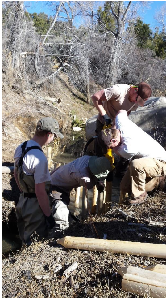
Beaver Dam Analog (BDA) construction