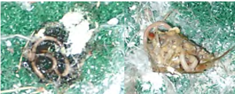
A roundworm in a mute and in a casting

Roundworms are a parasitic infestation of the digestive system by a nematode, Ascarida galli . Typical signs of this disease are diarrhea, weight loss, and sometimes foul smelling mutes. There are many ways that a bird can get roundworms, and most birds in the wild have at least a low level infestation. If you are out hunting with your bird the chances are that it is exposed to these, either through rabbits or birds it is catching. After you trap and after you have ended the hunting season, it's a good idea to get to your vet for a check-up and have a fecal done to ensure your bird is not carrying worms. These are easily treated, and can cause a lot of problems from general condition and malaise at hunting to delaying a moult. The worms are sometimes found in the bird's mutes or castings. If reviewing your own fecal slides, this can be mistaken for Coccidia. Note that these are much bigger than Coccidia.