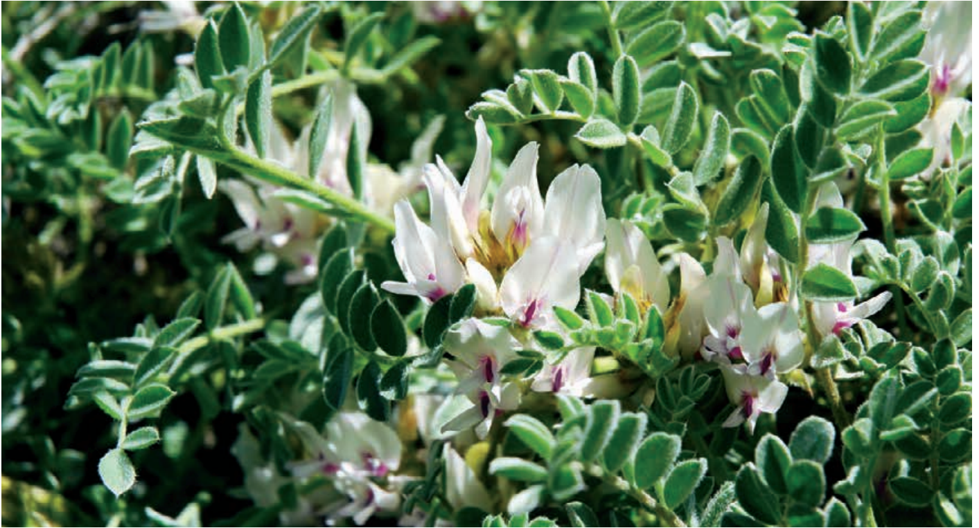
The U.S. Fish and Wildlife Service has proposed delisting Utah's native Desert milkvetch.