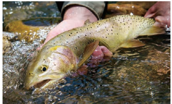
Bonneville cutthroat trout

New partnerships among river advocates, businesses, conservation groups, government agencies and other organizations are already making a difference for the Weber River and its fish.