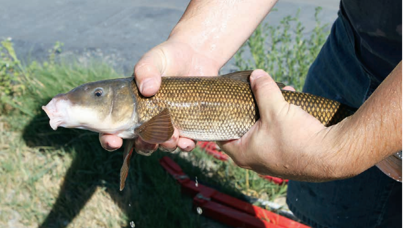
Once numbering fewer than 1,000 fish, there are now tens of thousands of June suckers in Utah Lake.