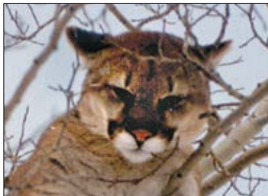
Adult female head