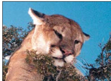
Adult male head